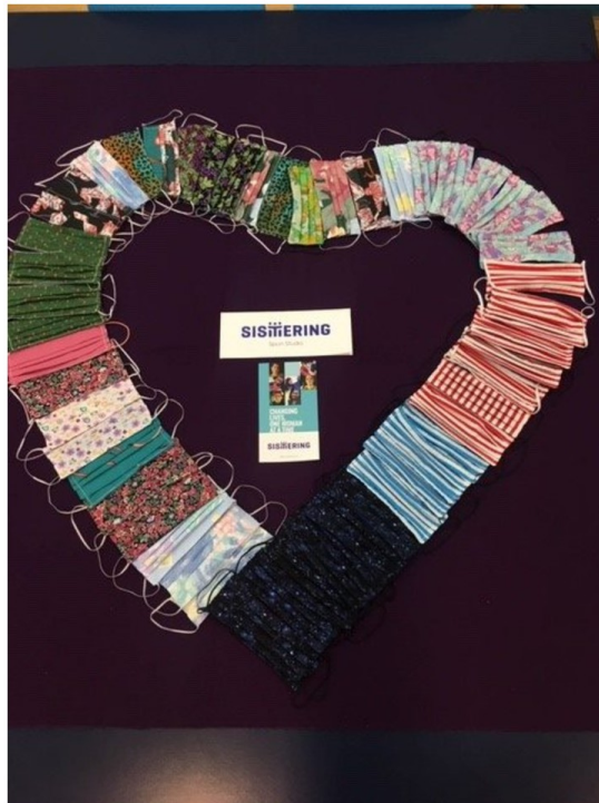
At the start of the pandemic, Spun Studio participants swung into action, making fabric face masks for the Sistering staff.

Fast forward to 2019, and Sistering's textile and fibre-crafting community included as many as sixty-five participants in what is now known as Spun Studio . The Spun program includes classes and recreational groups for sewing, embroidery, quilting, weaving, knitting, crochet, beading, and macramé.