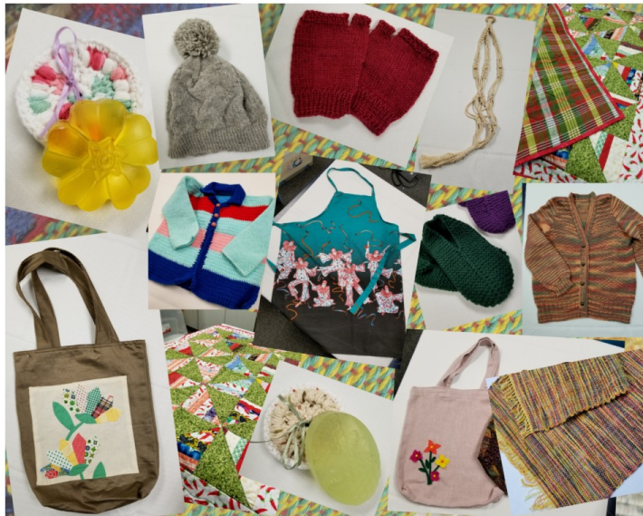
Threads of hope. A small selection of the many bags, table linens, aprons, scrubbies, garments, accessories, quilts, macramé hangers, and more, created by Spun Studio participants.