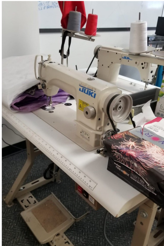
One of several industrial sewing machines at Spun, ready and waiting for participants to return to in-person classes and workshops.

Now located on Toronto’s busy Bloor Street West, Sistering welcomes a diverse community of women and trans folks whose experiences may include violence, substance use, mental health issues, disability, immigration, and poverty. Sistering participants have access to a 24-hour drop-in centre, a team of doctors and nurses, housing counsellors, harm reduction services, and an innovative, textile-based social enterprise called Spun Studio.