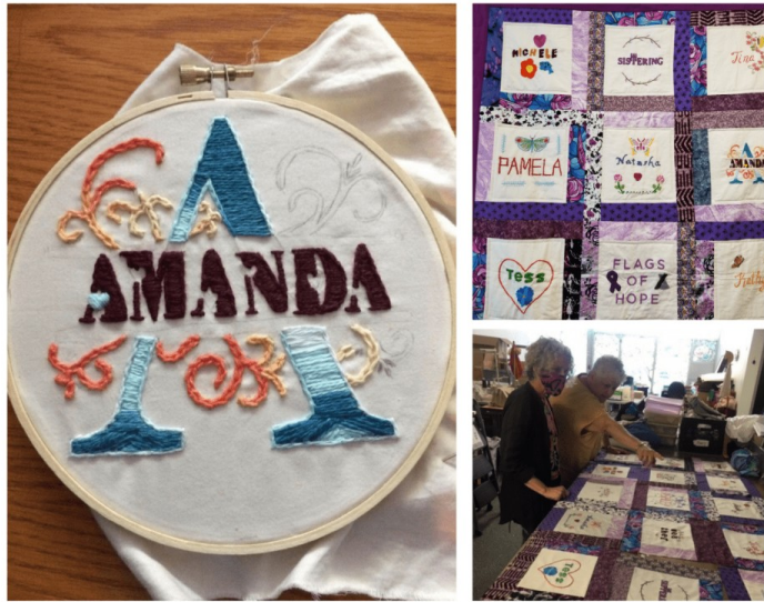
"Flags of Hope." Clockwise from left: Close-up of one of the flags being created for "Flags of Hope;" a section of the completed quilt; Sue points out one of the flags to a visitor.