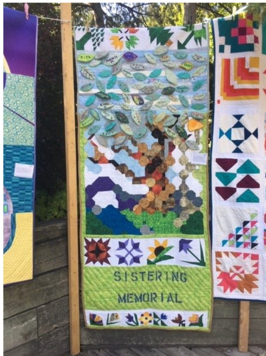
The Sistering Memorial quilt. Made by Spun Studio participants, this quilt honours women from Sistering who have passed away, giving each of them a fabric leaf inscribed with their name.